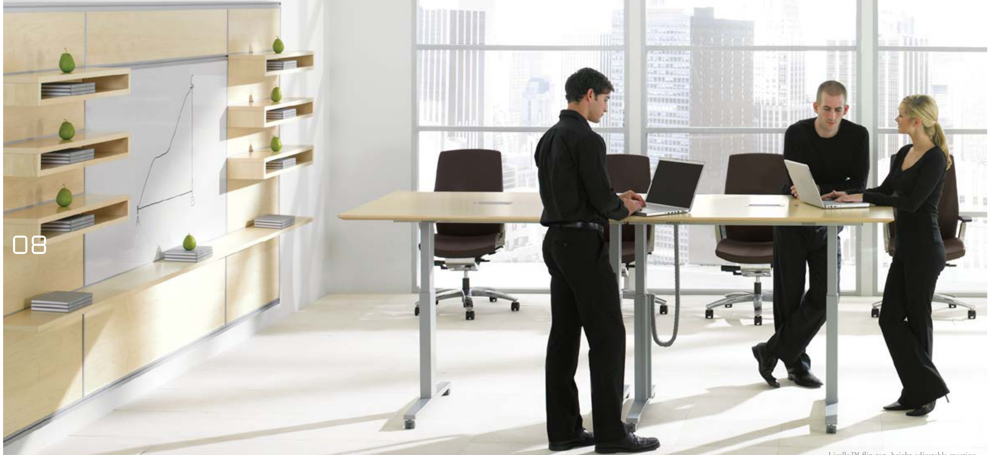
livello meeting table Surface: Natural Veneer, Natural Maple Edge Style: Full Knife Edge Leg: Mica, Platinum

Livello™ flip-top, height-adjustable meeting tables move quickly into place for casual meetings and, when the area is required for other uses, nest and store in minimal space. Livello meeting tables are ideal for sit-to-stand collaboration, promoting user comfort by encouraging movement and a neutral back posture while standing.