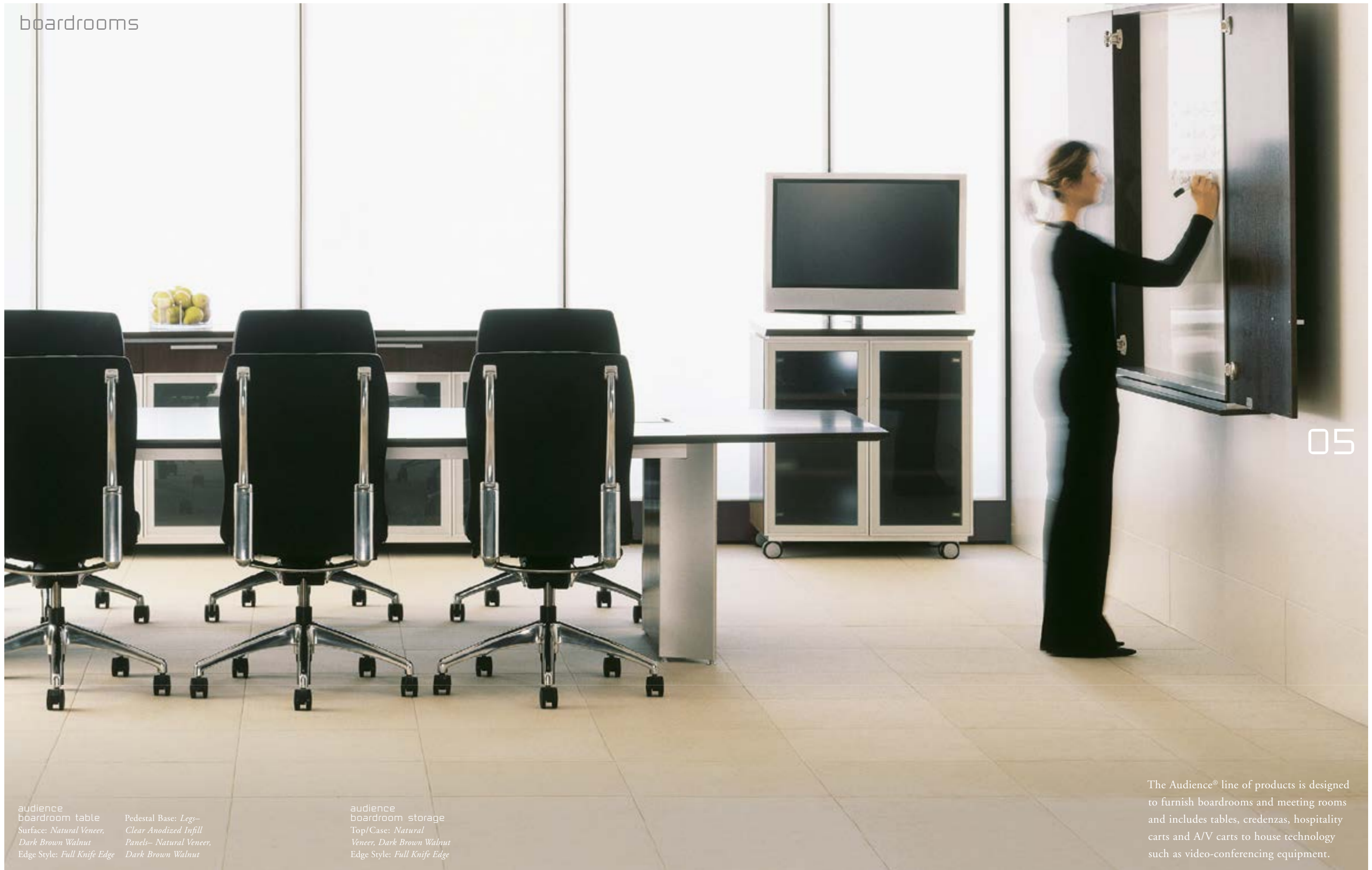
audience boardroom table Surface: Natural Veneer, Dark Brown Walnut Edge Style: Full Knife Edge Pedestal Base: Legs- Clear Anodized Infill Panels- Natural Veneer, Dark Brown Walnut