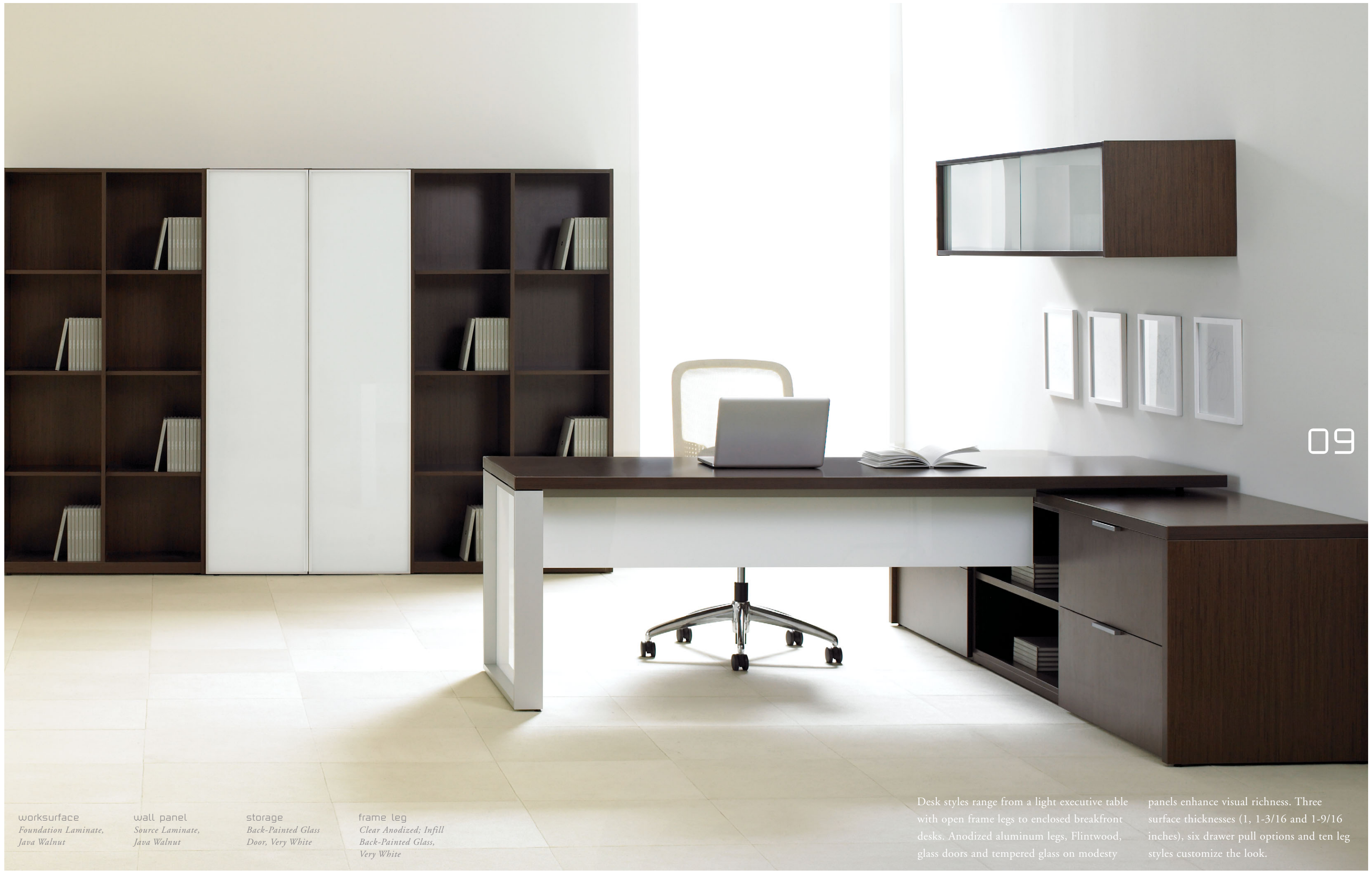
worksurface Foundation Laminate, Java Walnut